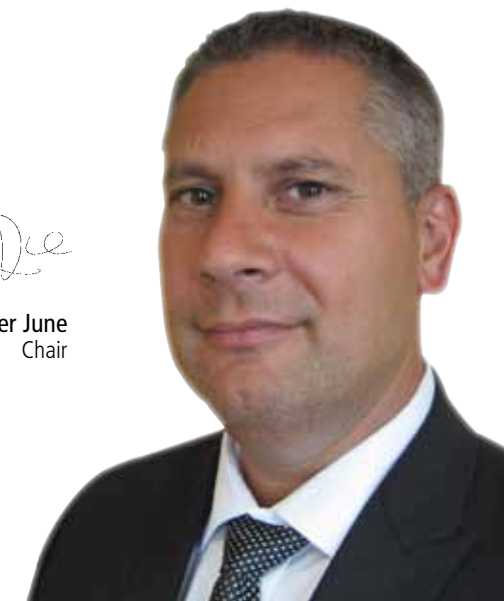
Christopher June Chair